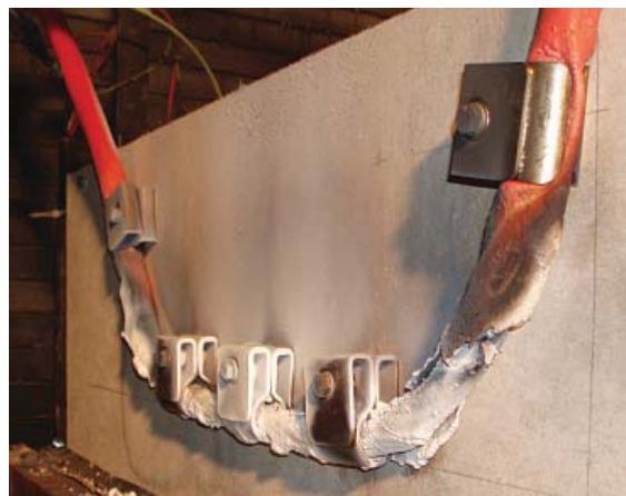
Circuit integrity test