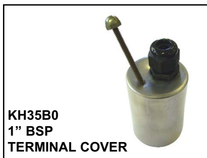
KH35B0 1" BSP TERMINAL COVER